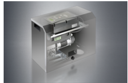
Horizontal control unit means that the control unit and the control elements are easily accessible.