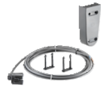
End cap (H 85 mm)