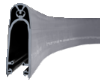
Safety contact strip, electrical, 8.2 kOhms (H 85 mm)