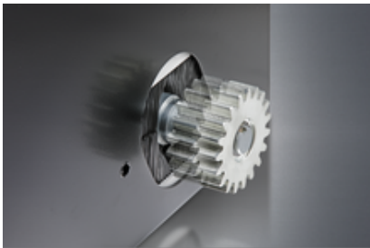
The shaft distance between pinion and operator can be adjusted in 4 steps (40/46.7/53.3/60 mm).